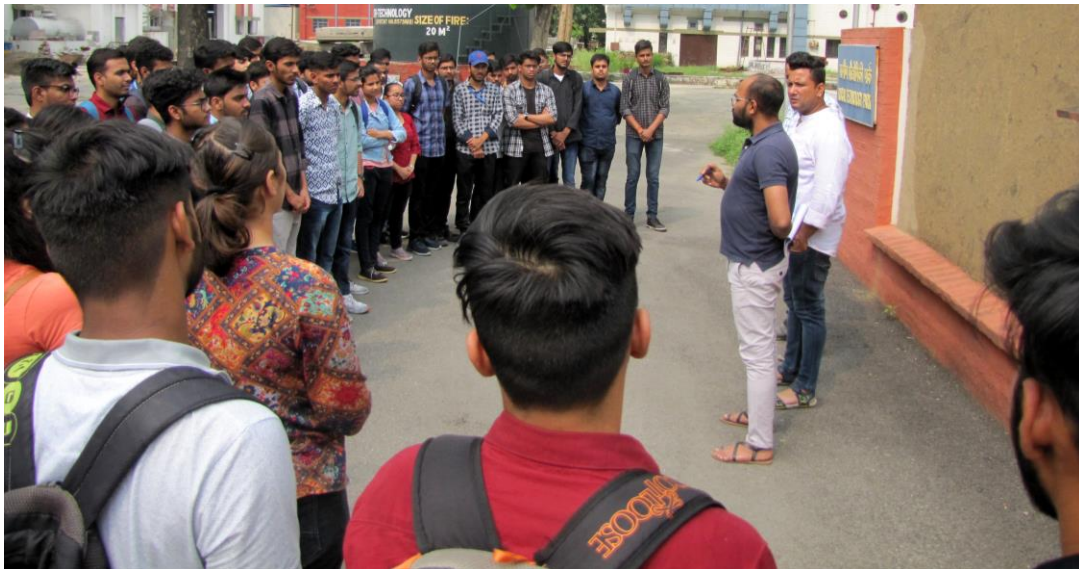
Rural Park Visit