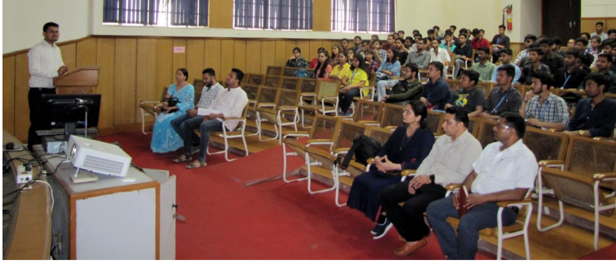
Interaction with Visitors