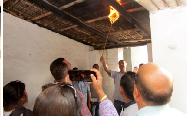
Visit to R&D Laboratories & Rural Technology Park