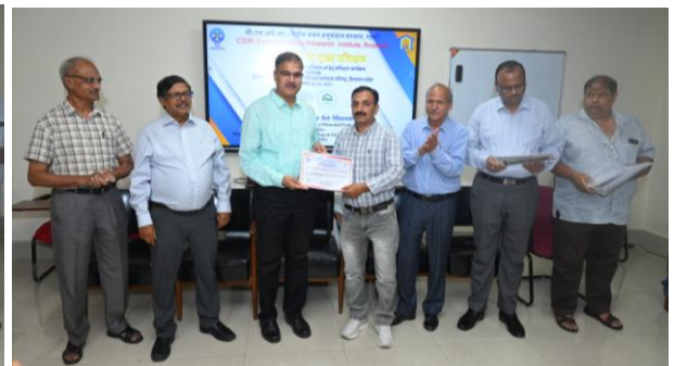
Valediction & Certificate Distribution