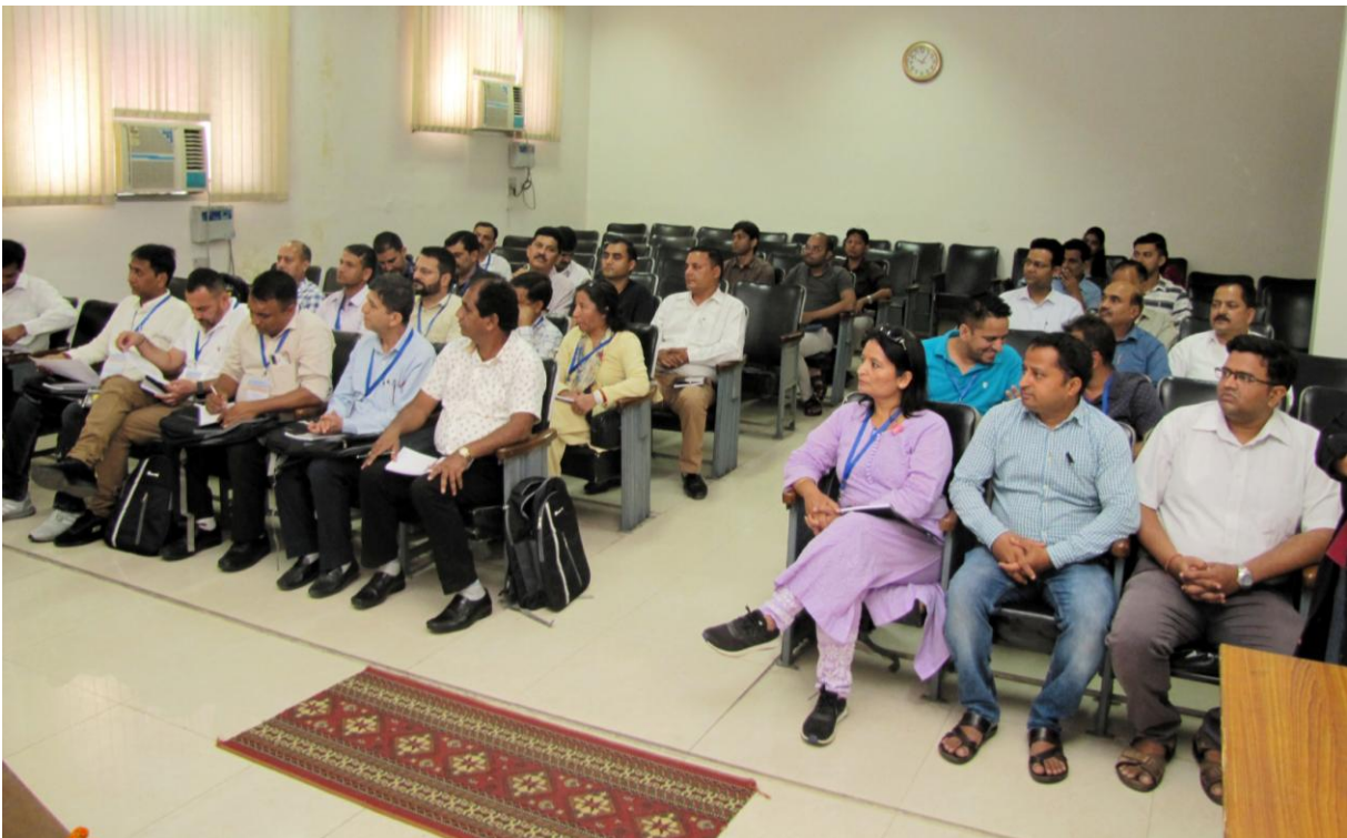
View of Participants