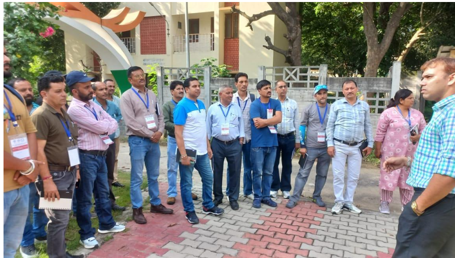
R&D Labs & Demo Park Visit