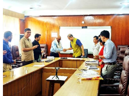
Self-compacting Aircrete Composite (SAC) Roof/ Floor Screed for Thermal Insulation (SAC Screed)