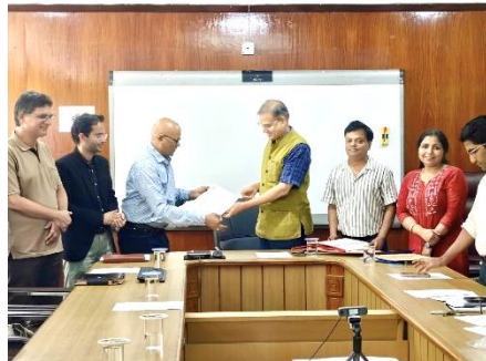
Specific Strength Attributed Self-Compacting Load Bearing Lightweight Roof/Floor Screed Using Sintered Lightweight Aggregates