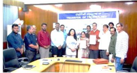
Flooring- Wall Tiles, Bricks, & Paver Blocks Using Marble Waste