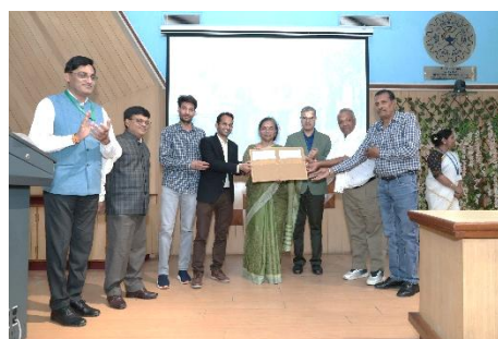
High Strength Valorized Paver Block using Granite Waste