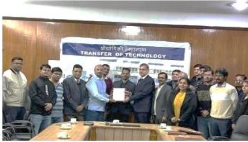
Low-Carbon Cement Concrete Composites using Sustainable Chemical Admixtures