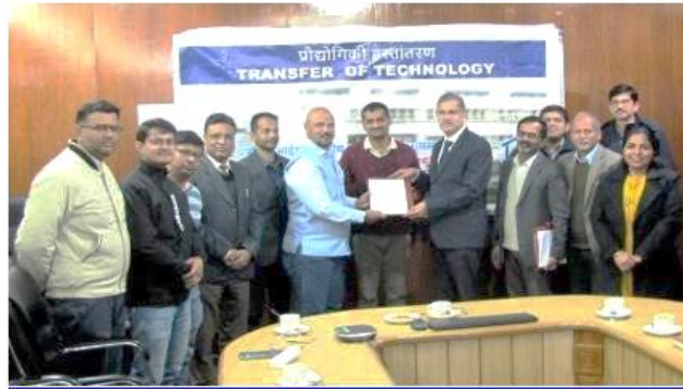
Innovative Cool Roof