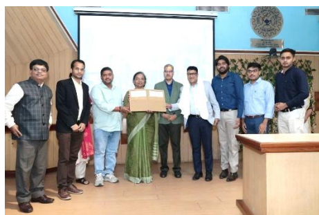
Process know how for preparation of Biomass Derived Materials